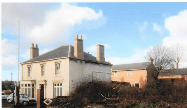
Wednesfield's old police station, late 1960s

"The Police station was a large house and the entrance had a window with a hatch to which the general public came for various reasons. The main door led to the 'charge room' which contained a switchboard, radio, sergeant and a civilian clerk, this room was where the officers coming on duty were paraded by the sergeant for their various assignments.