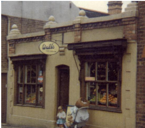
Hinton's fruit & Veg, New Street