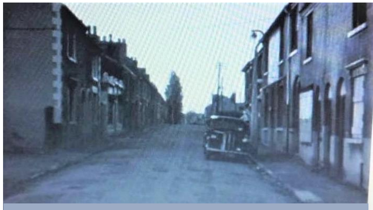
The car is outside the Talbot opposite Hinton's fruit & Veg, New Street

Wolverhampton Road - The Police station was in Wolverhampton Road. If you went down New Street and turned right it was about 50 yards on the right, (yes in those days it was yards and not meters) mind you many of us prefer to still use yards rather than the new confangled meters. Anyway, the following information was given by Lily Daish a few years ago.